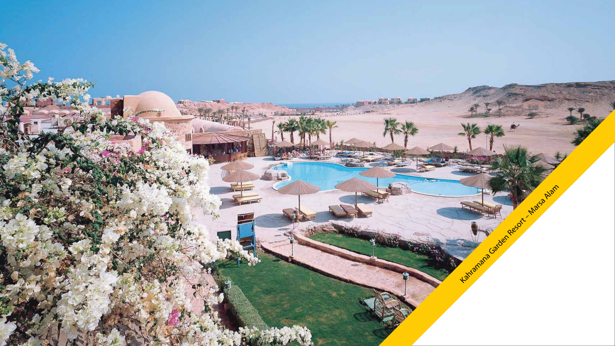
Kahramana Garden Resort – Marsa Alam