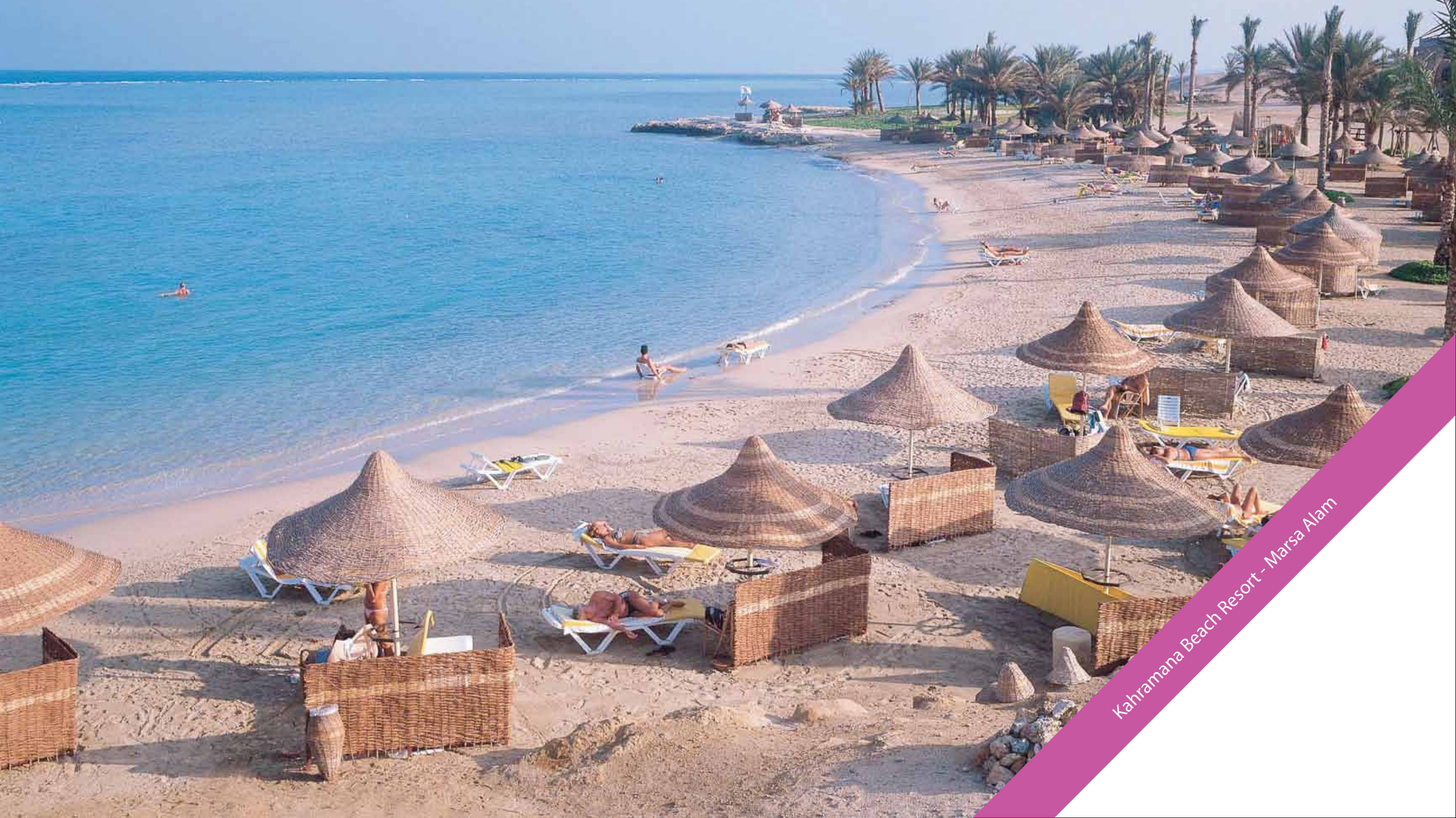
Kahramana Beach Resort – Marsa Alam