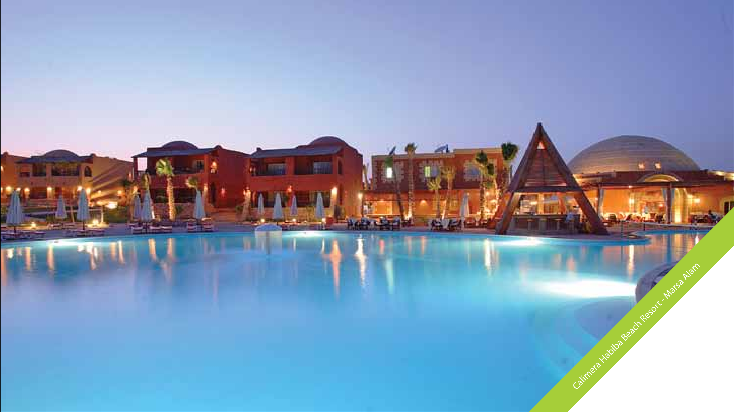
Calimera Habiba Beach Resort - Marsa Alam