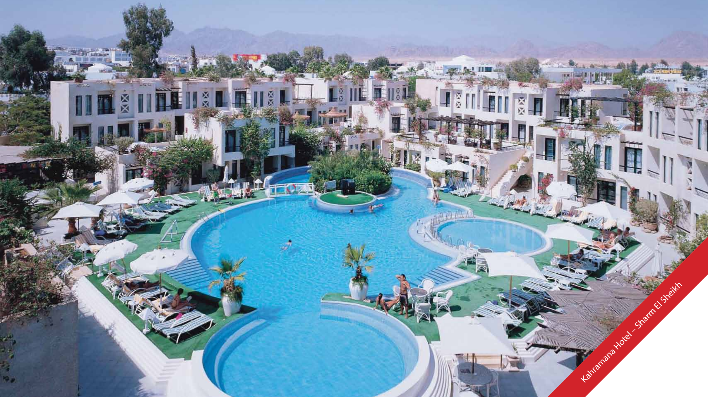
Kahramana Hotel – Sharm El Sheikh